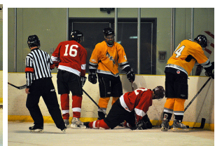
2009 Premier Final between Sharks and Marlins