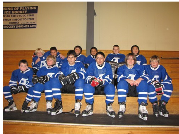
2009 Peewee Flames (Avondale) and Hornets (Botany)