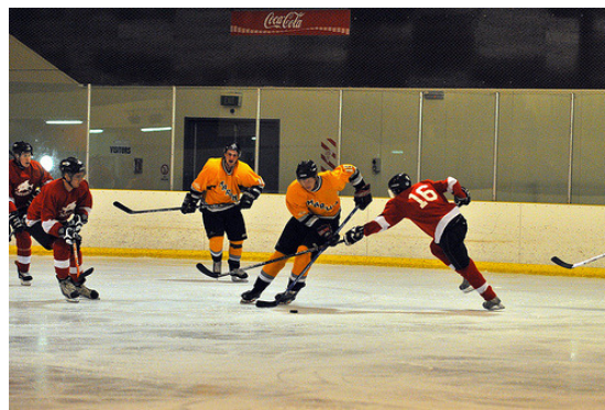
2009 Premier Final between Sharks and Marlins