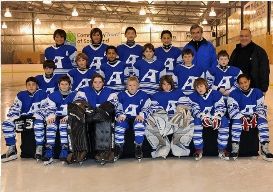
2010 Auckland Pee wee Team— Gold at the Nationals